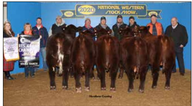
Reserve Grand Champion Pen of 5 Shorthorn Bulls - Leveldale Farms, Mason City, Ill.