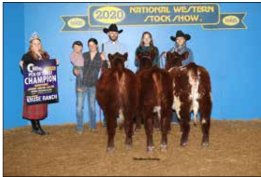
Division Champion Pen of 3 Shorthorn Heifers - Junior Heifer Calves - GSKI Shorthorns, Snyder, Colo.