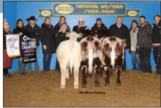
Reserve Grand Champion Pen of 3 Shorthorn Heifers - Horton Farms, Saint Charles, Ill.