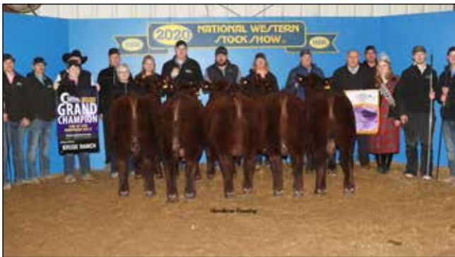
Grand Champion Pen of 5 Shorthorn Bulls - Jungels Shorthorn Farm, Kathryn, N.D.