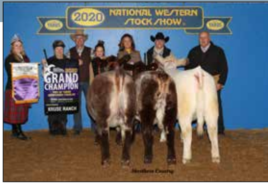
Grand Champion Pen of 3 Shorthorn Heifers - Pearl Valley Shorthorns, Valley City, N.D.