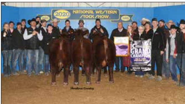
Grand Champion Pen of 3 Shorthorn Bulls - Jungels Shorthorn Farm, Kathryn, N.D.