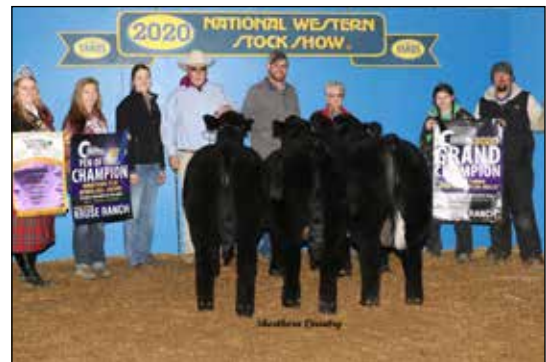
Grand Champion Pen of 3 ShorthornPlus Bulls - Stepping Stone Ranch, Edson, Kan.