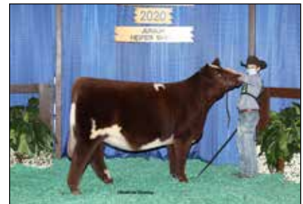
Reserve Intermediate Champion Female - CF CSF Cumberland 9102 HC X ET, Carter Wickard, Wilkinson, Ind.