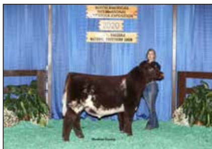
Early Spring Bull Calf Champion - CF Maskerade 070 BW X, Cates Farms & LSA Shorthorns, Royse City, Texas.