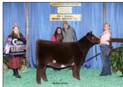
Early Spring Heifer Calf Champion - CSF Dream Lady 2118 AV ET, Cornerstone Farms, Winchester, Ind.