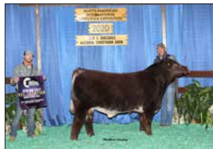
Senior Bull Calf Reserve Champion - CFS Ghost Rider 123G, Clark Farms Shorthorns, Pleasantville, Iowa.