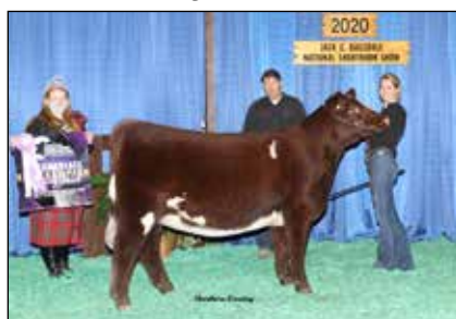
Reserve Intermediate Champion Female - CF Crystals Lucy 9100 RK X ET, Simon Farms.