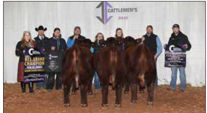
Reserve Grand Champion Pen of 3 Shorthorn Bulls - Gilman Shorthorns, Stuart, Iowa