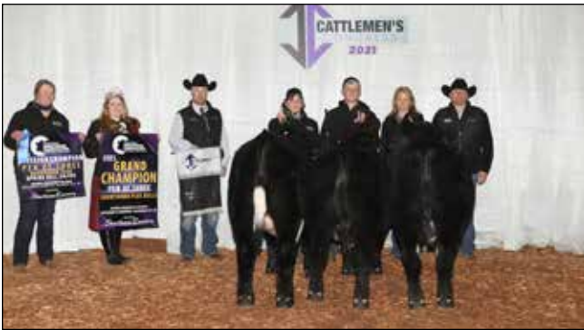
Grand Champion Pen of 3 ShorthornPlus Bulls - Jungels Shorthorn Farm, Kathryn, N.D.