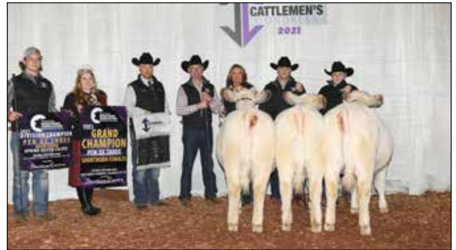
Grand Champion Pen of 3 Shorthorn Heifers - Pearl Valley Shorthorns, Valley City, N.D.