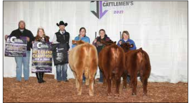
Reserve Grand Champion Pen of 3 ShorthornPlus Heifers - Lakeside Farms, Hersey, Mich.