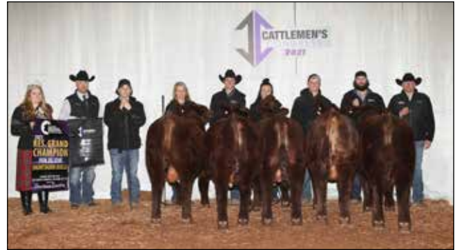
Reserve Grand Champion Pen of 5 Shorthorn Bulls - Jungels Shorthorn Farm, Kathryn, N.D.