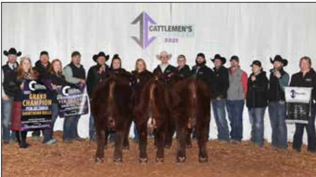
Grand Champion Pen of 3 Shorthorn Bulls - Jungels Shorthorn Farm, Kathryn, N.D.