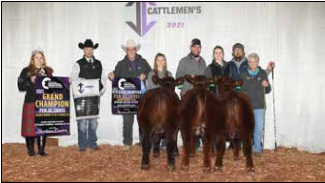
Grand Champion Pen of 3 ShorthornPlus Heifers - Stepping Stone Ranch, Edson, Kan.