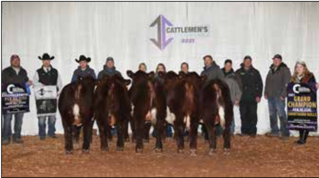
Grand Champion Pen of 5 Shorthorn Bulls - Paint Valley Farms, Millersburg, Ohio